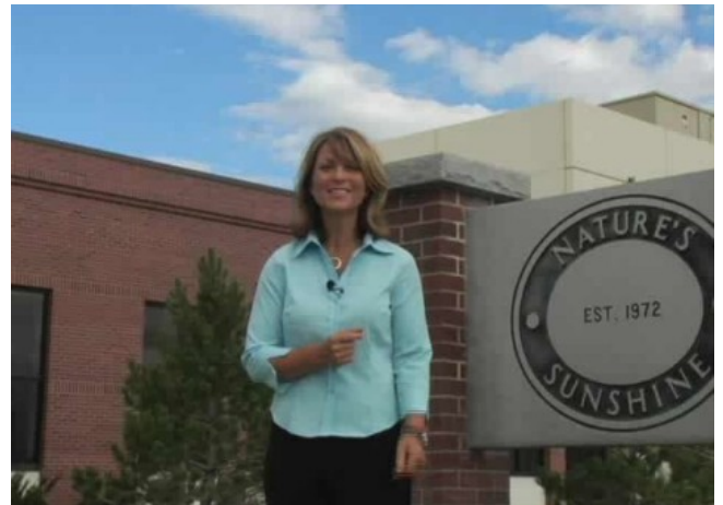
Click on the Nature's Sunshine Products Quality Assurance video above to play – run time 13:25