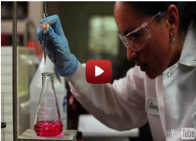
Click on the Synergy Quality Assurance video above to play – run time 5:49

The following two videos will provide you with addition information about Synergy Worldwide and Nature's Sunshine Product's commitment to quality assurance standards second to none in the nutrition industry.